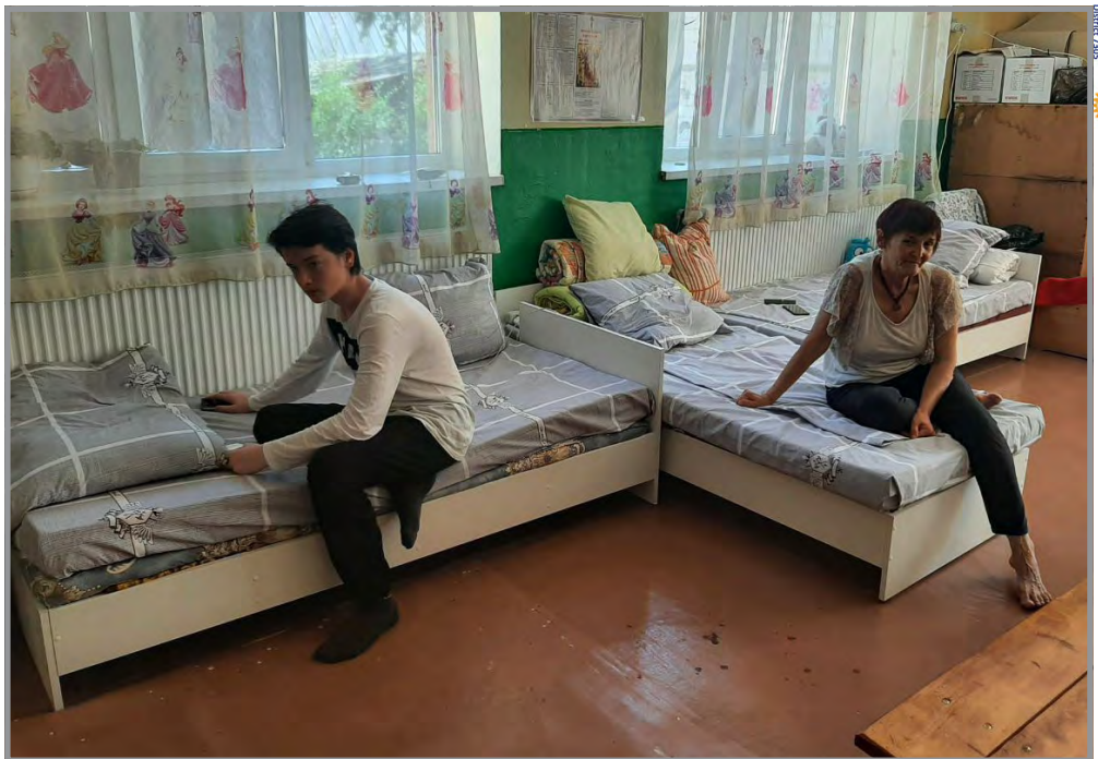
A $25,000 Disaster Response Grant plus $5,000 from the Rotary Clubs of Crafton-Ingram, New Brighton, and McMurray was used to purchase beds and linens for a shelter in Kyiv, Ukraine.

I want to thank the committee members for all their efforts to bring so many of these projects to the committee and to see these projects through to completion. I also want to thank all the Rotarians of Rotary District 7305 for their support of The Rotary Foundation. It is only through your generous contributions to The Rotary Foundation that we