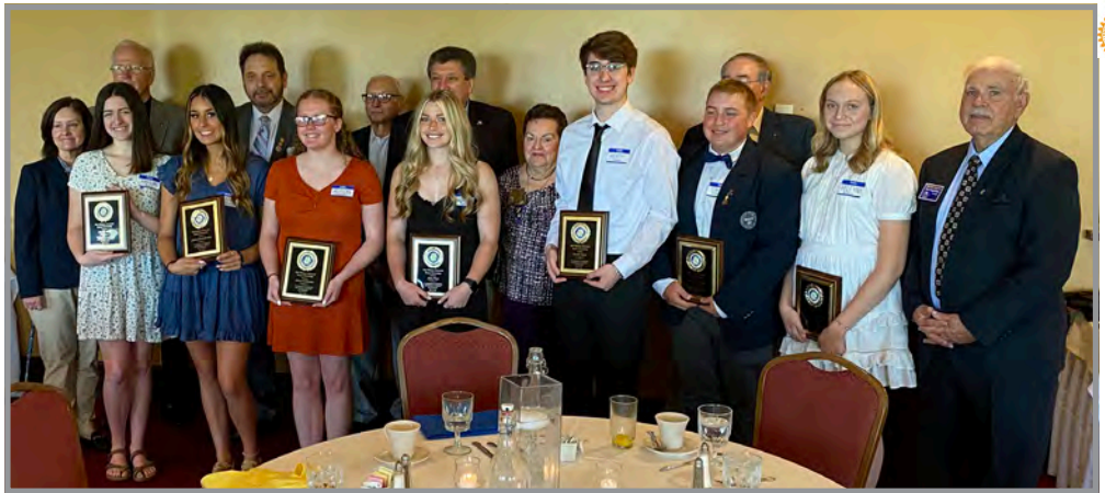
Pictured are the 2022 recipients of the Bob Williams Memorial Rotary Scholarship. They are presently attending universities all around the nation, including Bucknell, Penn State and The University of Virginia. Also pictured at the award's ceremony are members of The Rotary District 7300 Foundation, who have fiduciary responsibility for the scholarship, and members of the selection committee.